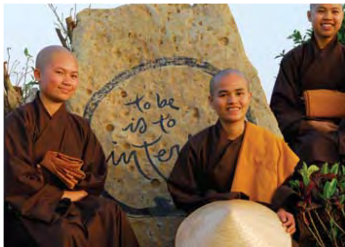
Newly ordained nuns at Bat Nha Monastery before it was violently closed down by the Vietnamese government. The stone behind them reads: "To be is to interbe."

In September of 1965 Nhat Hanh announced that the School of Youth for Social Service (SYSS) would be founded as a program of Van Hanh University. The response was overwhelming; more than a thousand young idealists applied for the three hundred places in the program. But in 1966 the Unified Buddhist Church revoked its endorsement because they feared Nhat Hanh was in league with the Communists. SYSS, however, was able to